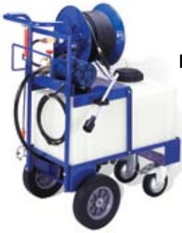
MSO Sprayer with Optional 20 Gallon Tank & Hose Reel