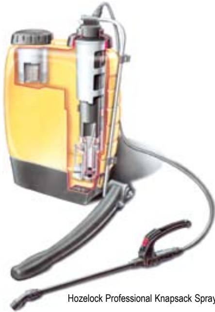
Hozelock Professional Knapsack Sprayer