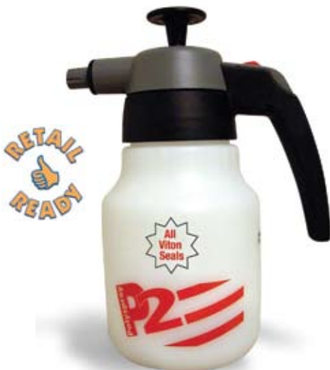
Polyspray 2- 2.5 pints