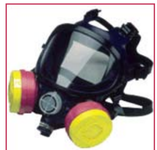
Full Face Respirator