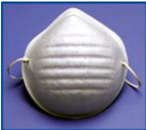
Disposable Nuisance Dust Mask