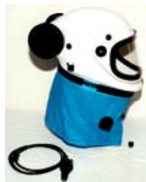
Professional 88 Protective Helmet with two built-in fan units and two filters for gas and dust.